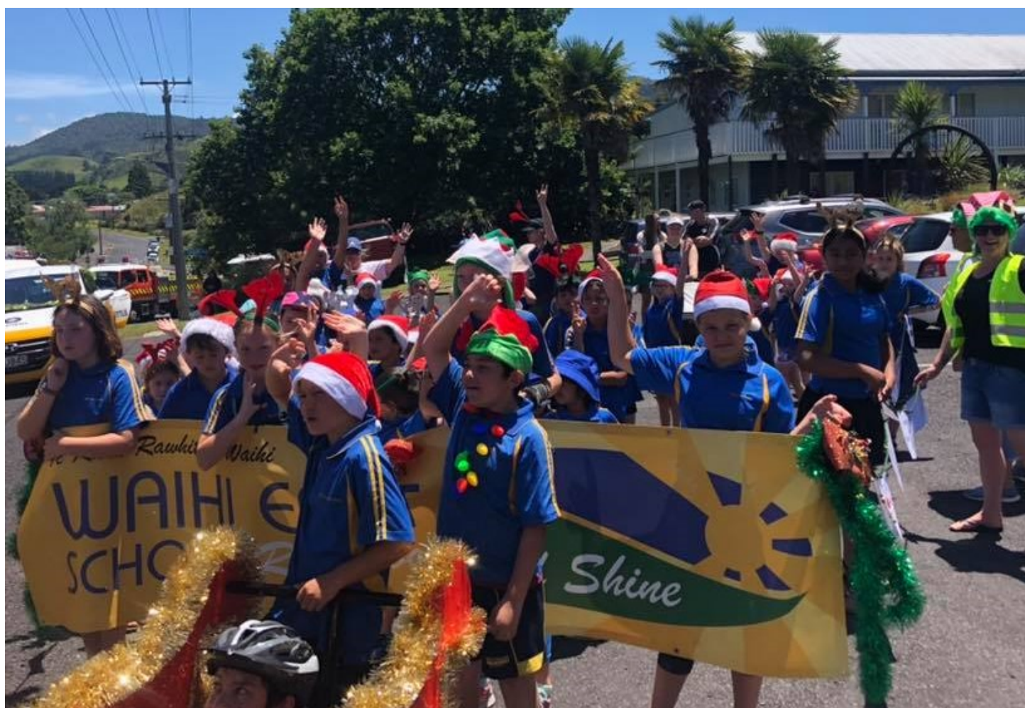
2018 Santa Parade

Waihi East Primary School Newsletter Term 4 2018 Week 9 12 December 2018