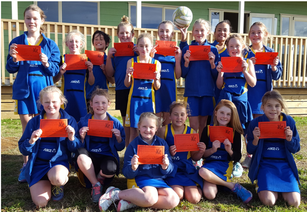
Waimata Netball Tournament Winners—East Sunrise and East Galaxy

Waihi East Primary School Newsletter Term 2 2018 Week 8 21 June 2018