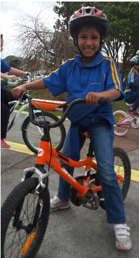
Below; Term 3 Wheelie Day.