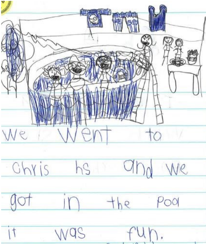
By Jenny Y, age 6, room 8.