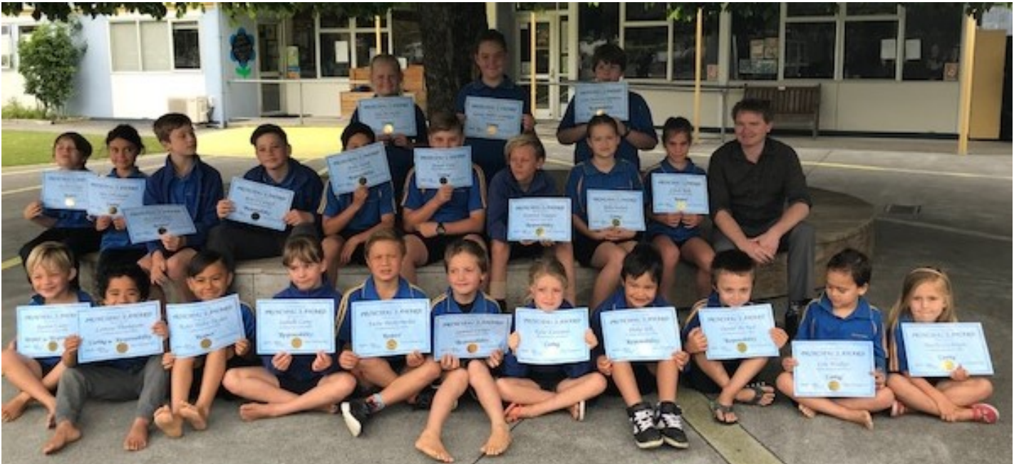
Principals Awards representing our School values—Caring, Respect & Responsibility

Waihi East Primary School Newsletter Term FOUR Week 7 30 November 2017