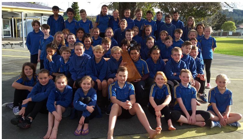
Below; All our awesome tapuwae teams.