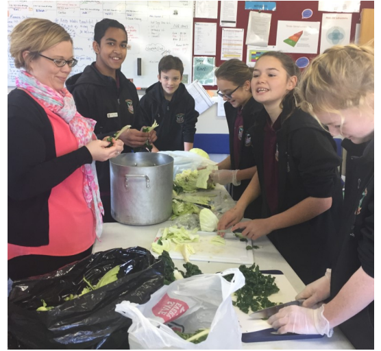
Below and right ; Boil Up End of term 2.