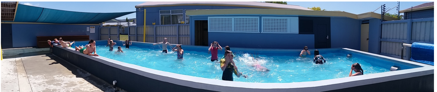
Room 2 enjoying our pool!