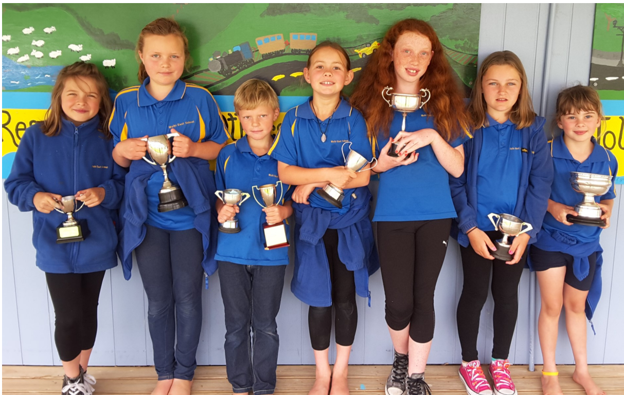
Waihi East Calf Club Cup Winners