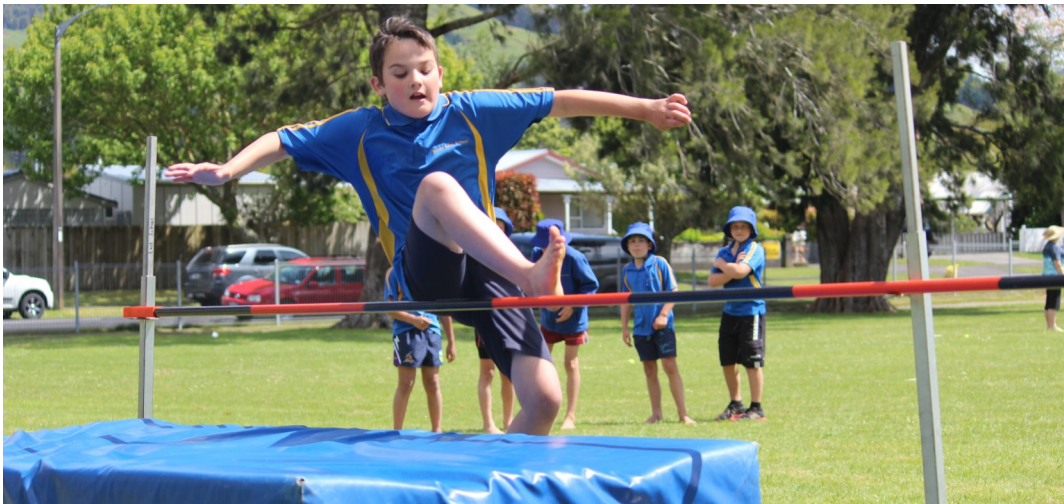
Below; High jump at East Athletics.