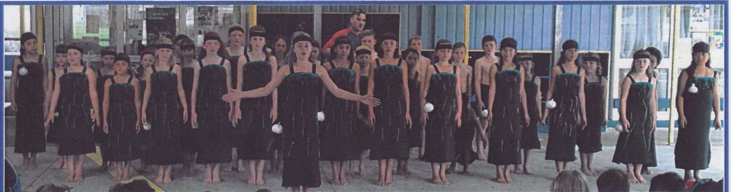
Kapahaka Dress Rehearsal today.