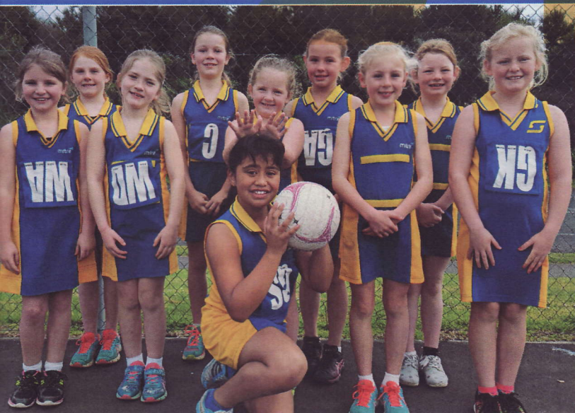
Top Left; Year 4 Suns. Closing Day.