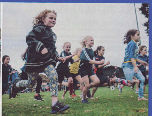
Waihi Schools Cross Country.